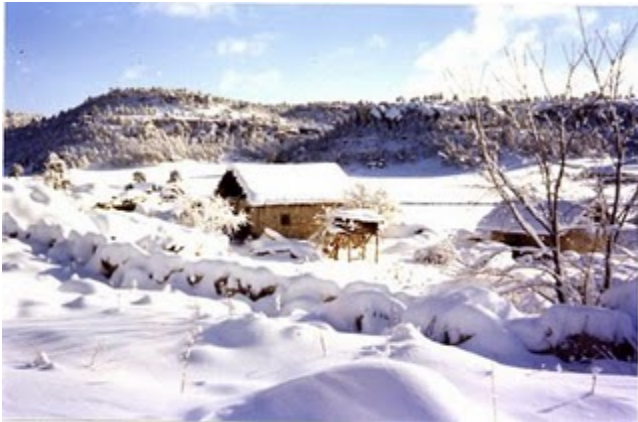
La Rosilla, Durango: Mexico's Icebox

reached -20C (-4F) on February 5, 2011 – cold, but not a local record. Apparently the coldest air was too shallow to reach the high valley. Lows around -18C (zero F) have occurred several times this winter in La Rosilla, and apparently the town has a reputation as the "Frostbite Falls" of Mexico.