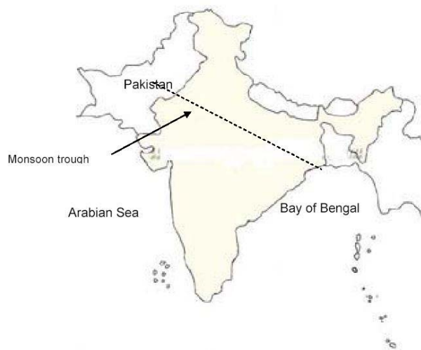
Figure 2: Outline map of India and Pakistan showing normal July position of monsoon trough axis.

States of Rajasthan, Punjab and Kashmir which are adjacent to Pakistan. Per latest statistics (as of August 25 2010), from the India Meteorological Department, the seasonal rainfall over the northwestern Indian States has already exceeded 125% of the normal.