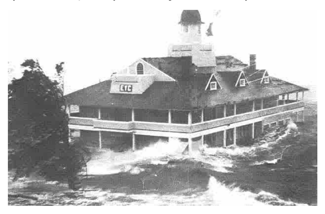
Edgewood Yacht Club withstands the storm surge from Carol in Edgewood, Rhode Island.

Sustained winds of 80 to 100 mph roared through the eastern half of Connecticut, all of Rhode Island, and most of eastern Massachusetts. Scores of trees and miles of power lines were blown down. Strong winds also devastated crops in the region. Nearly 40 percent of apple, corn, peach, and tomato crops were ruined from eastern Connecticut to Cape Cod. Several homes along the Rhode Island shore had roofs blown completely off due to winds which gusted to over 125 mph. The strongest wind ever recorded on Block Island, Rhode Island occurred during Carol when winds gusted to 135 mph. The National Weather Service in Warwick, Rhode Island recorded sustained winds of 90 mph, with a peak gust of 105 mph. Lowest recorded pressure was at Suffolk County Airport on the south shore of Long Island with a reading of 28.36. Block Island reported 28.51 while Quonset Airport in North Kingstown, Rhode Island reported 28.72.