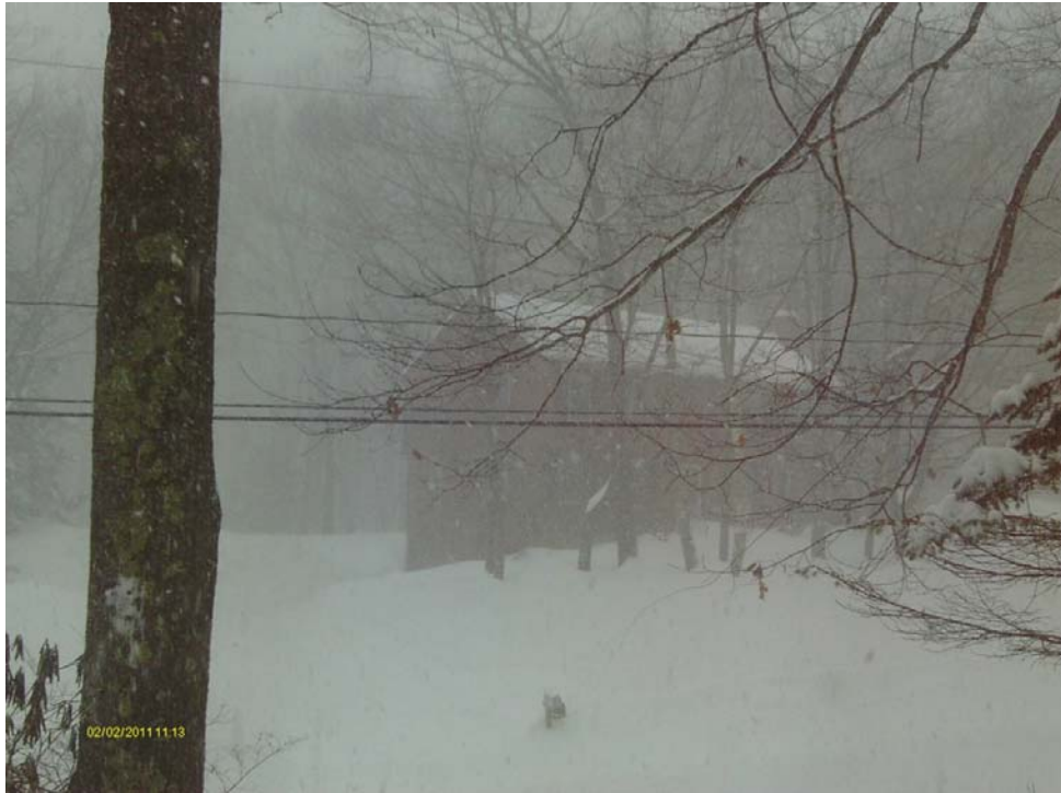
The next is my home before the snow blower did its final pass.