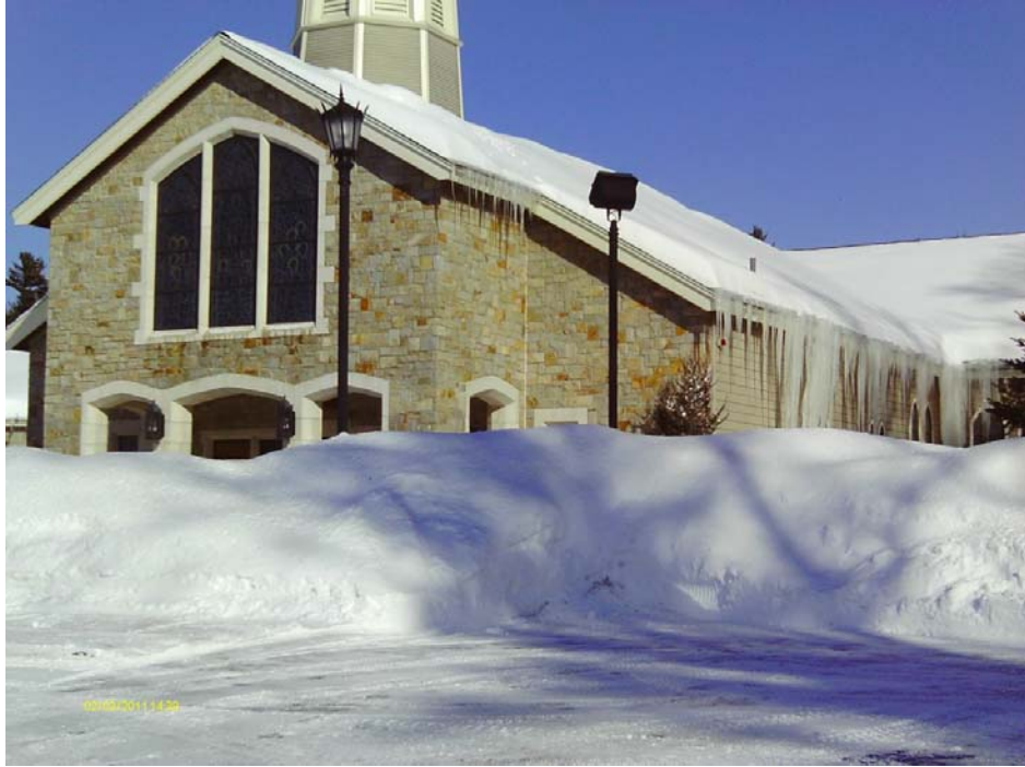
This other church photo that has gone viral says it all.