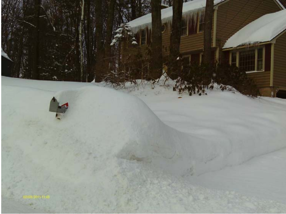
I have to get a snow rake for my roof.