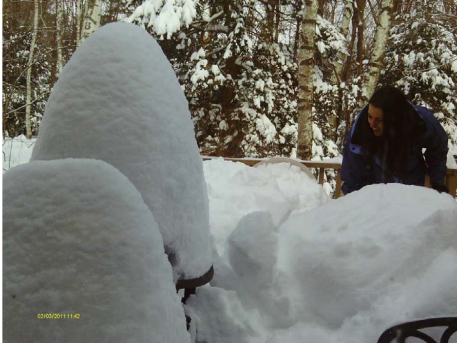
Attention Walmart shoppers: this week free snow, help yourself in the parking lot.