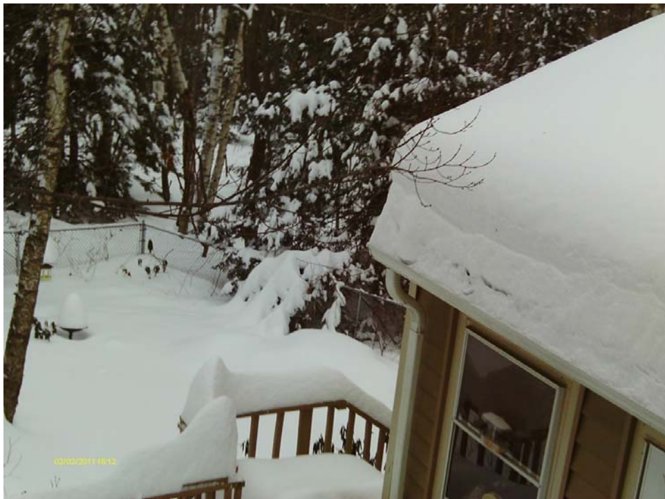
My daughter shoveling snow off my deck to prevent collapse.