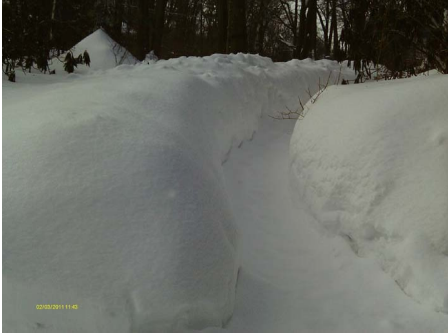
Here is the snow during the heart of the storm.