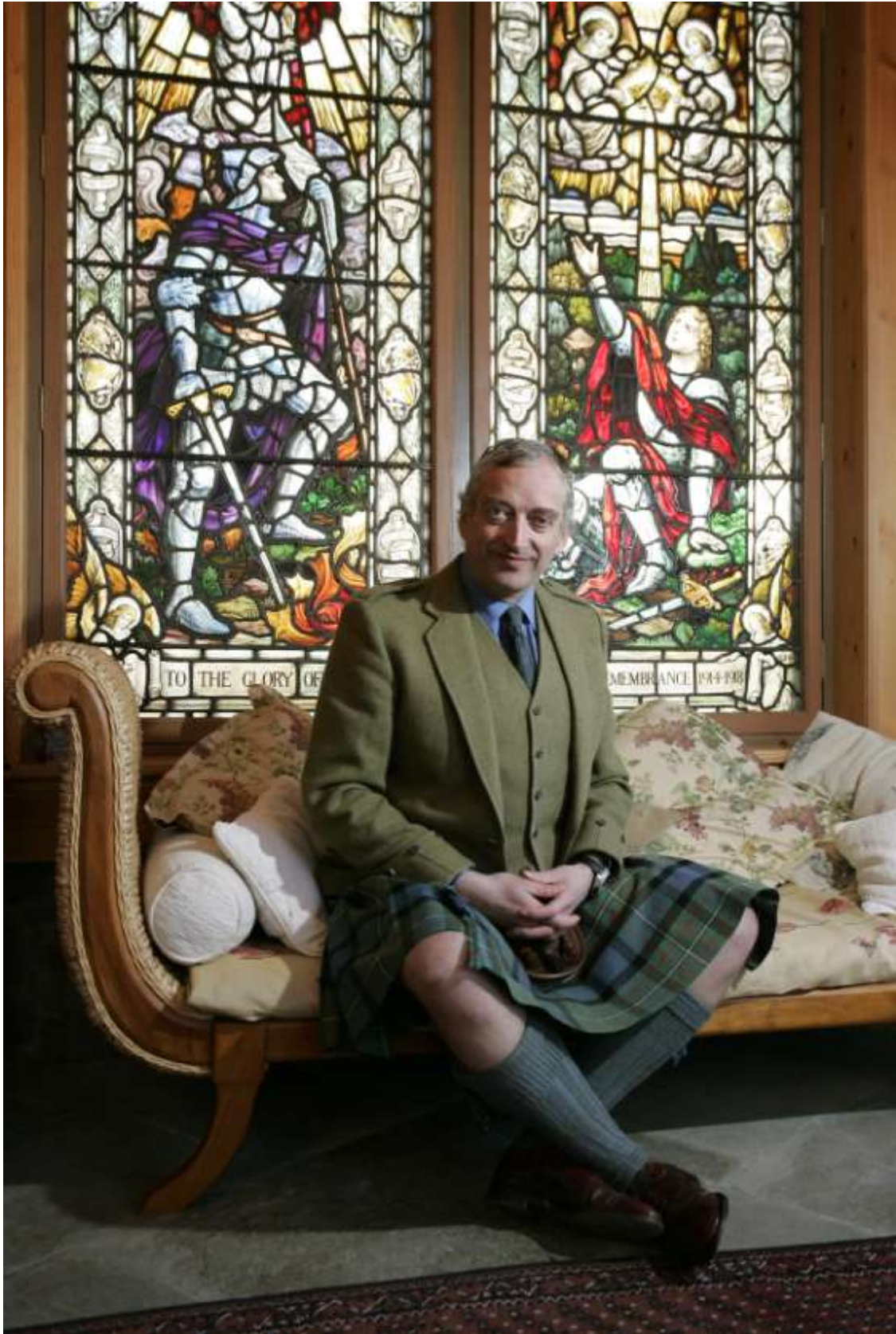
The Viscount Monckton of Brenchley in the Summer-House at Carie, his Highland seat